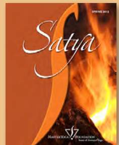
Receive our quarterly online member publication

If you've completed Foundations, you are eligible for this affordable professional membership. Click here to join!